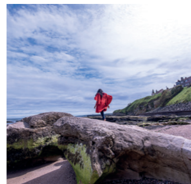
View from Castle Sands