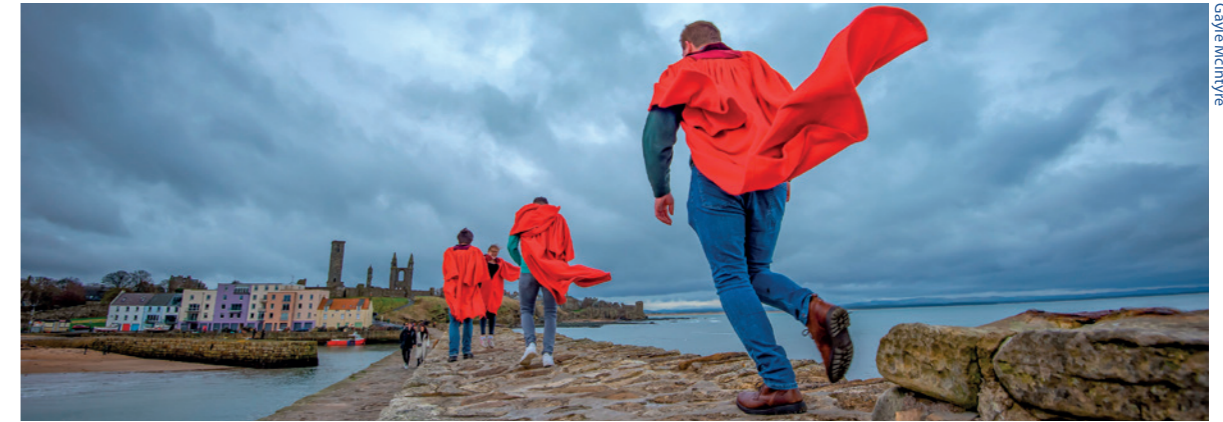
Socially distanced pier walk