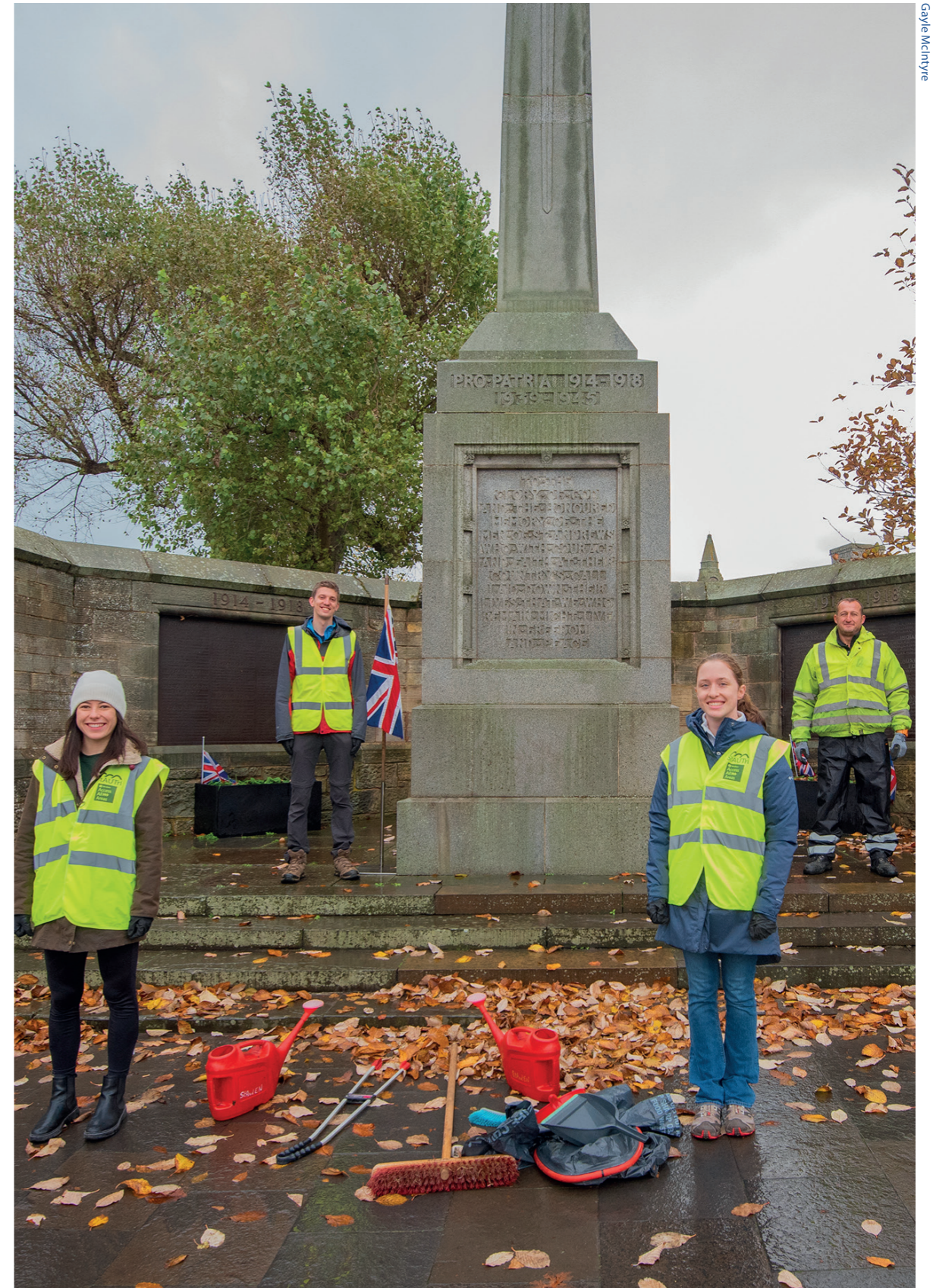
Can Do Community Action Day

Gifts were also received from eight anonymous donors