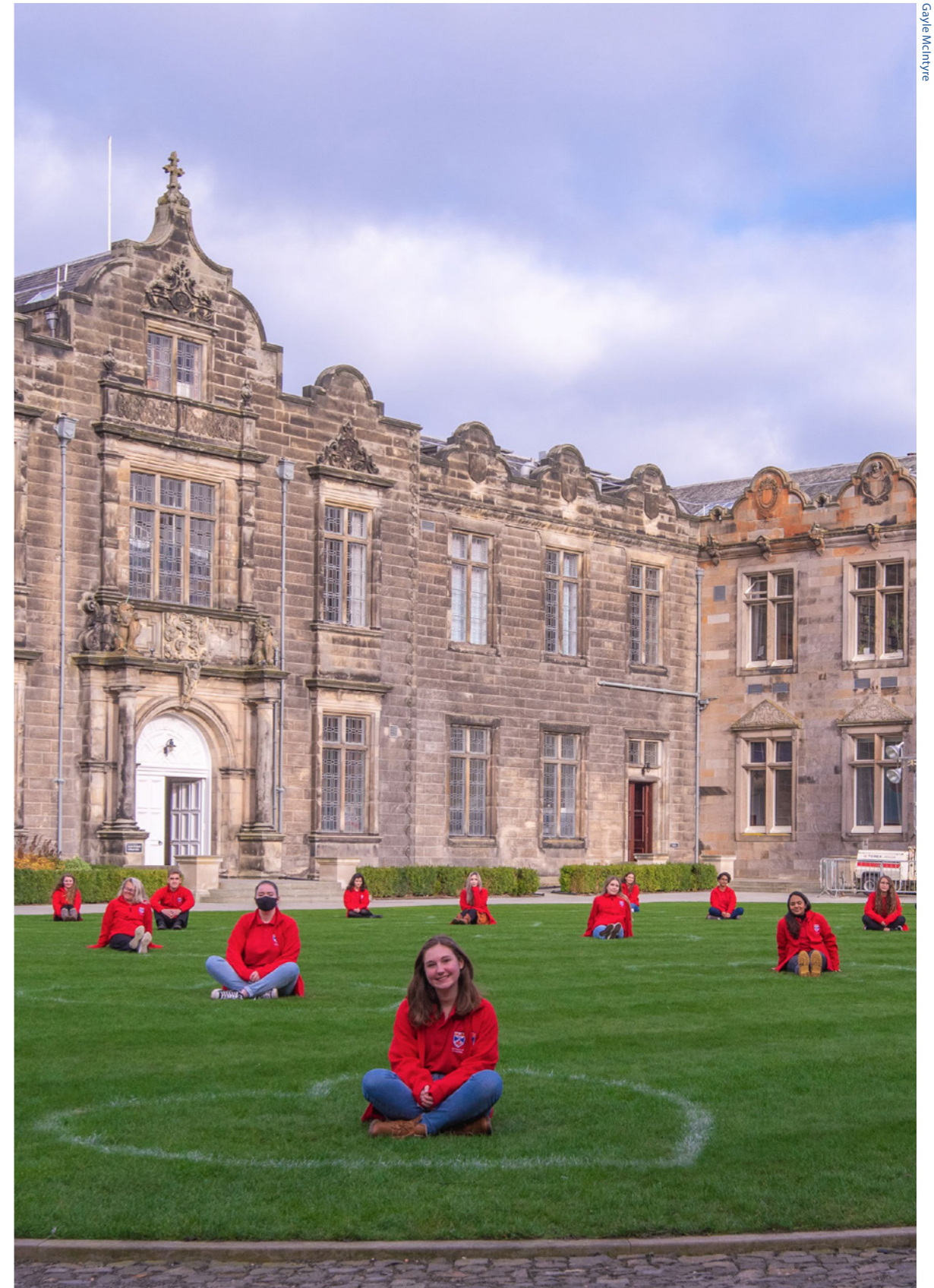
Socially distanced hearts in St Salvador's Quad

Gifts were also received from 397 anonymous donors