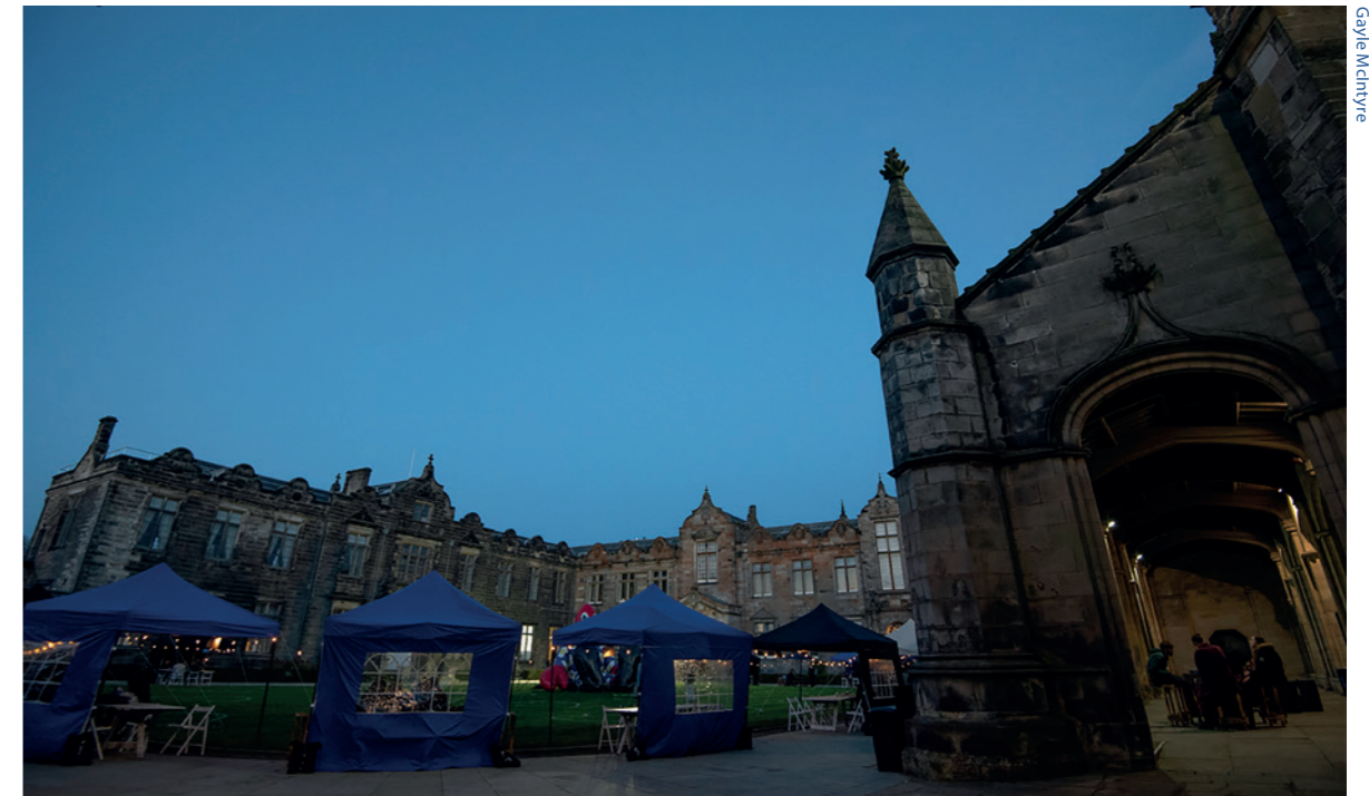
Can Do Cocktails in the Quad